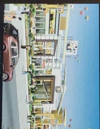
COMPLETED CENTURY 21 Mall HOSHANGABAD ROAD