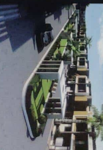
ONGOING GLOBUS Canal Cottage HOSHANGABAD ROAD