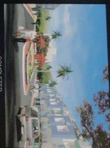
COMPLETED GLOBUS Greenia LA GHANI