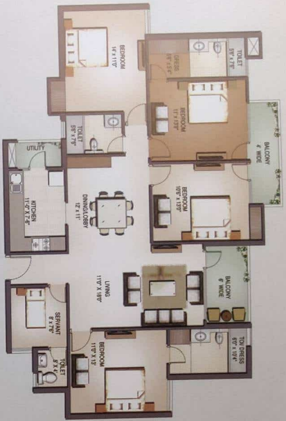
4 BEDROOM + 4 TOILET + SERVANT ROOM (Area 2177 S.ft.)