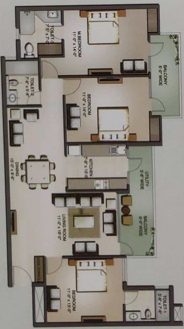
3 BHK + 3 TOILET UNIT PLAN (Area 1356 S.ft.)