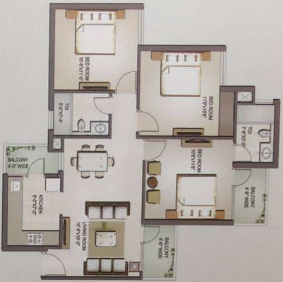
3 BHK + 2 TOILET UNIT PLAN (Area 1246 Sft.)