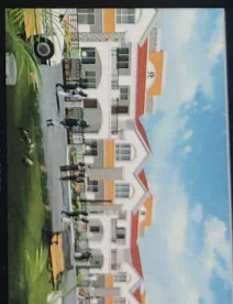
COMPLETED GLOBUS Fair City CHHINA BHATTI