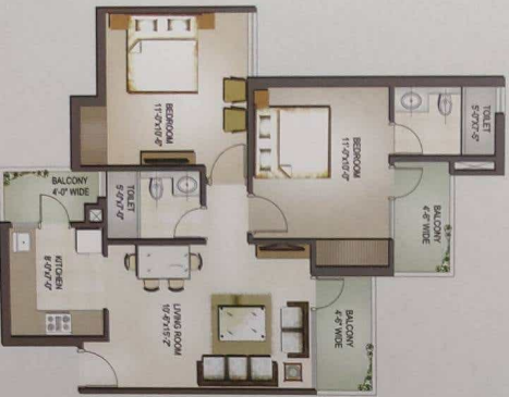
2 BHK + 2 TOILET UNIT PLAN (Area 982 Sft.)