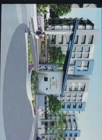
COMPLETED GLOBUS Sycora LA GHANI