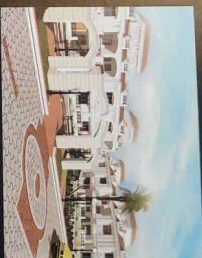
COMPLETED GLOBUS City CHHINA BHATTI

THE COMPANY PROFILE Globus Housing Pvt. Ltd., a professionally managed group in real estate, stands for such qualities as vision, strength, integrity, optimum resource management, and quality consciousness. The group has already earned a name for understanding and fulfilling the needs of its customers. Globus City, Globus Fair City and Globus Greens are some of the projects that have been recently developed by the group. Also Globus Green Acres and C2 mall are some of the ongoing projects which hold a lot of promise. Thus, Globus Housing has a brilliant track record of successful projects both in residential as well as commercial arenas. And now, Coral Woods is all set to create a benchmark of its own!