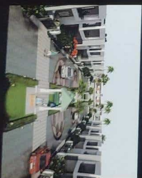
ONGOING GLOBUS Canal Cove Near Bhirpur Bhat Price Bypass