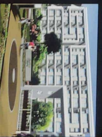
ONGOING GLOBUS Sycora at Mahanagar Square Near International Airport